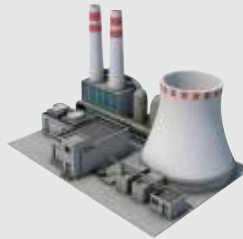
Oil & Power