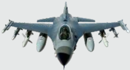
Defense & Aerospace